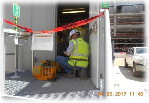
Sturgeon Electric -Banner Hospital