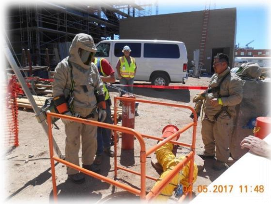
Sturgeon Electric - Banner Hospital