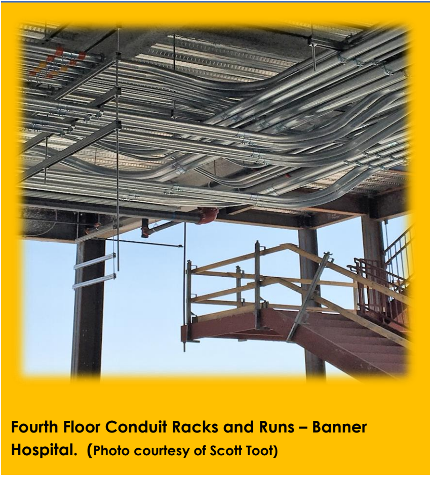
Fourth Floor Conduit Racks and Runs – Banner Hospital.