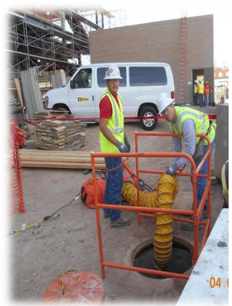
Sturgeon Electric - Banner Hospital